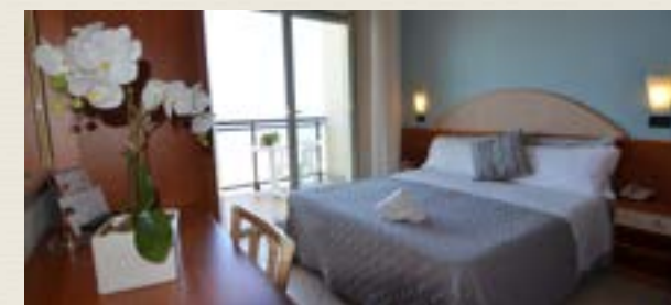
The room of 19 sq.m., is provided of a sea front balcony, minibar, air conditioning, hairdryer.

ATTIC ROOM SURCHARGE € 5,00 PER PERSON PER DAY