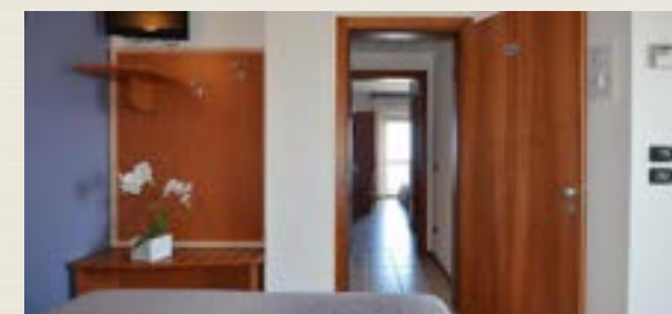
Formed by two connected rooms, each of 17 sq.m., is provided of a balcony, two bathroom, minibar, air conditioning, hairdryer. *** For the Family room children discount is agreed during the quote time.